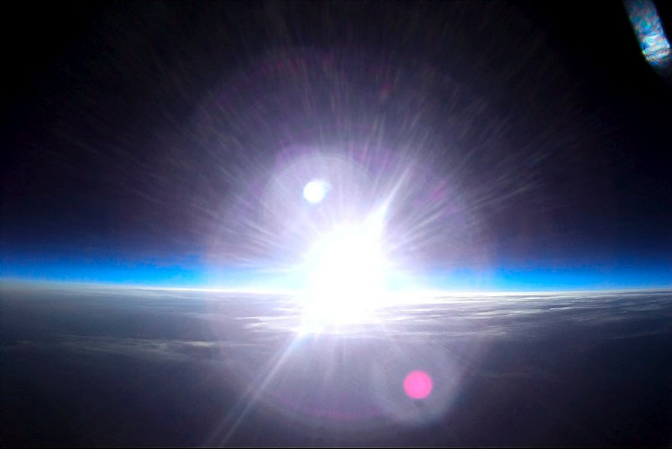
The sun as seen from our high-altitude balloon