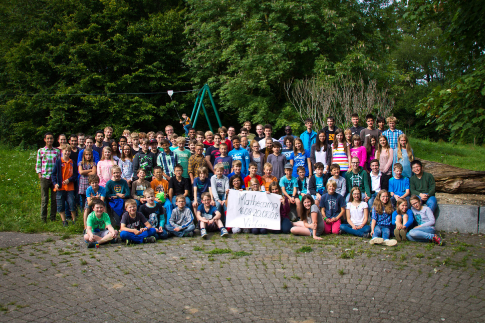
Participants of Augsburg's maths camp